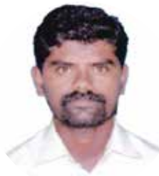
UMYAKUNJARAM DUBAI MALL (BACK OF HOUSE, DUBIA/NE)