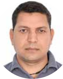
DHAN SINGH GARDEN MALL