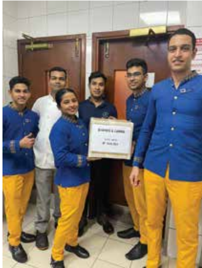
Sharing & Caring-2023 from IP Dalma

Collaborated with Red Crescent society, SFC group campaign of collecting non-perishable food items and hygiene items to send to needy families across the world