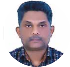
SASI KT (MAINTENANCE)