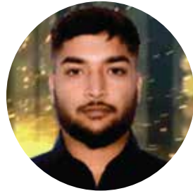
PRINCE KUMAR GOLDEN DRAGON (BACK OF THE HOUSE)