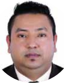
TEJ BAHADUR MUSHRIFF